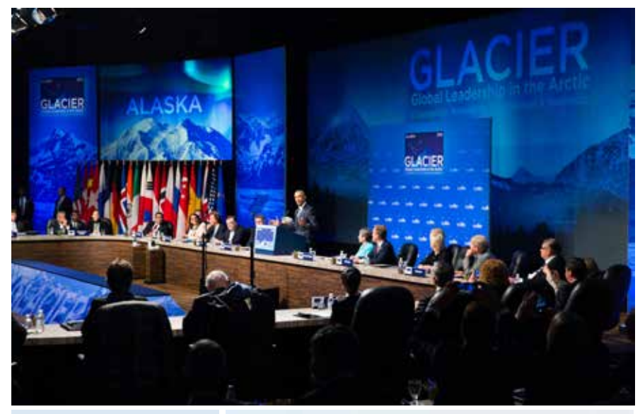
(ABOVE) President Obama addressing the GLACIER conference. (RIGHT) The US Coast Guard icebreaker Healy off Nome, Alaska.

For example, it calls on the Army Corps of Engineers to "evaluate the feasibility of" deepening and extending harbor capabilities in Nome, and if such a project is feasible, to develop a construction timeline for the project by 2020 (originally, on-site operations were tentatively scheduled to begin by 2020). Perhaps the Framework drafters had advance warning that the