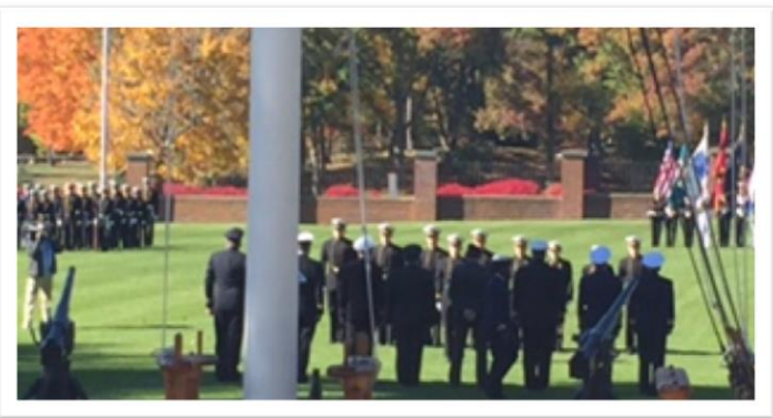
The international delegation's review of the Corps of Cadets during the Arctic Coast Guard Forum at the Coast Guard Academy in New London, Connecticut, October 30, 2015.

This inaugural Arctic Coast Guard Forum summit demonstrated a clear commitment to cooperation, led to the signing of the Joint Statement, and focused on operational common ground. One of the Forum's shining moments was the international delegation's review of the Corps of Cadets as a closing event.