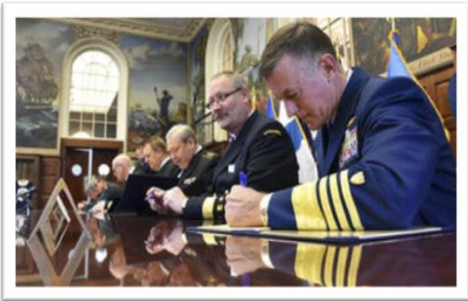
Coast Guard Commandant Adm. Paul Zukunft joins leaders representing all eight coast guard agencies of the Arctic nations to sign a Joint Statement officially establishing the Arctic Coast Guard Forum at the Coast Guard Academy in New London, Connecticut, October 30, 2015.

Arctic Coast Guard Forum: In October 2015, the U.S. Coast Guard Academy and the Coast Guard Headquarters' Marine Transportation Systems Directorate (CG-5PW) jointly hosted the inaugural Arctic Coast Guard Forum summit. The forum intends to bring together the eight Arctic states of Canada, Denmark, Finland, Iceland, Norway, Russia, Sweden, and the United States, to provide a platform for information sharing, coordination, and practical exercises.