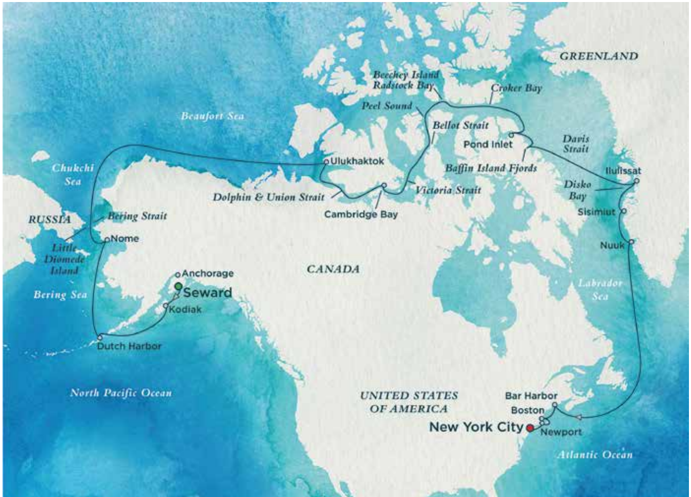
Route of the 2016 Crystal Serenity excursion by Crystal Cruises. Artwork courtesy of Crystal Cruises.

its vision for safe, secure, and environmentally responsible maritime activity in the Arctic. In March 2015, the Commandant of the Coast Guard joined the Navy and Marine Corps service chiefs in releasing the “refreshed” Cooperative Strategy for 21st Century Seapower. The Coast Guard released its Cyber Strategy in June of 2015. It followed the service’s Western Hemisphere Strategy, which was released a year earlier. The latter two strategy documents will likely have far-reaching implications for tasking and resource availability for the service’s Arctic operations. Of more immediate relevance is the Coast Guard’s Arctic Strategy Implementation Plan, which was scheduled for release in late December of 2015. After the International Maritime Organization gave its final approval to the Polar Code in 2015, the Coast Guard turned its attention to